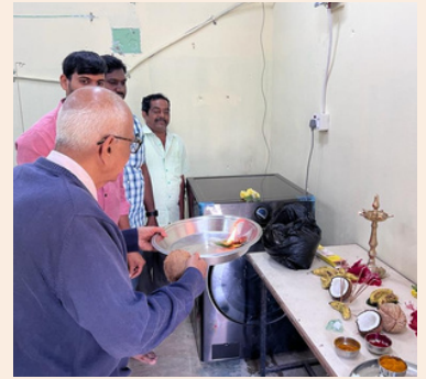
Inauguration of Laundry for Residential students