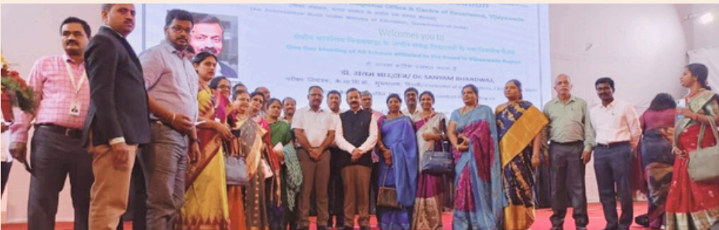
Principal's meet with Controller of Examinations, CBSE Vijayawada