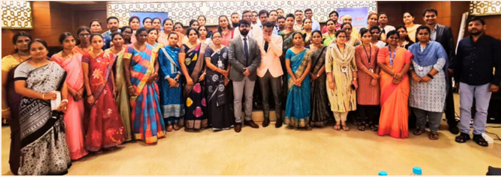
Understanding step-by-step Coding & Artificial Intelligence, Kips, Tirupati