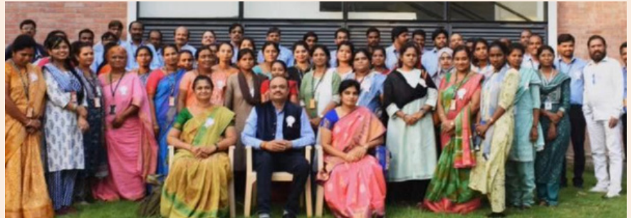
CBP - Vidyanikethan, Tirupati