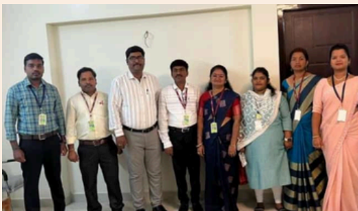
DAV Meet, Chennai